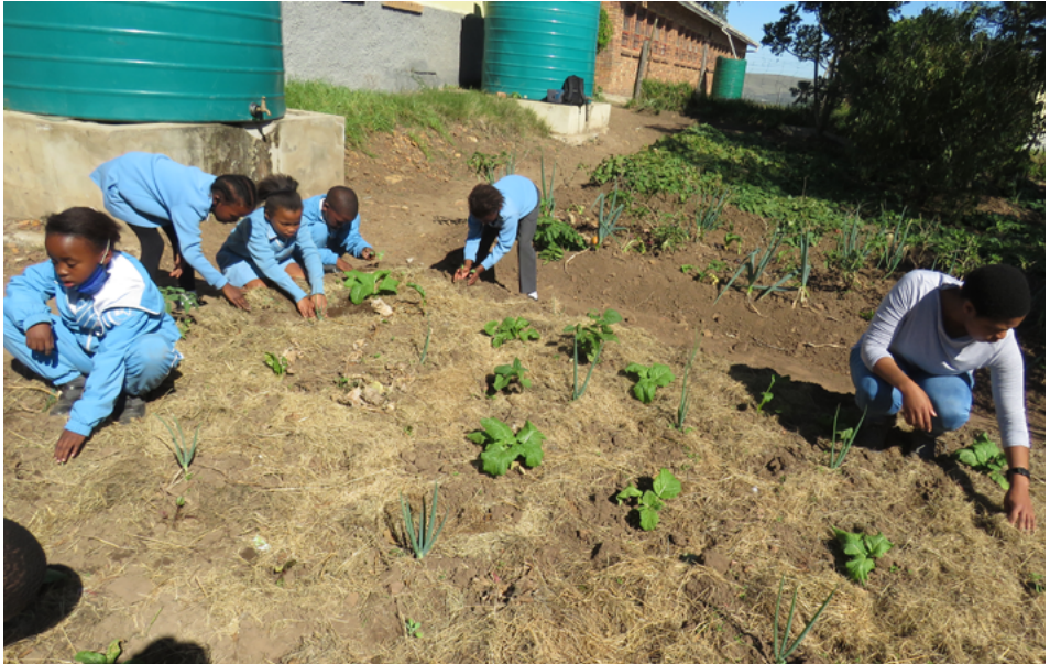
Archie Mbolekwa Primary School learners transplanting spinach and lettuce seedlings

in households, land use and farming operations by for example renovating houses and purchasing fencing - household indigenous seeds saving increased by 89%, crop bartering and provision of food crops for free to needy households increased by 31%.