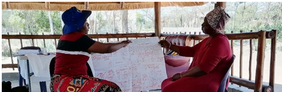
Permaculture Explorers doing mapping

The PE's produce vegetable crops such as spinach, cabbage, onions, carrots, and tomatoes, and introduced growing herbs - during the COVID19 pandemic the focus on medicinal herbs increased. The food gardens generate enough produce for the PE's household use, and surplus produce is sold to community members and at local busy areas at busy times, calling it "Tala Table" meaning "green table" in local Sepulana language. The PE's have acquired a communal plot of land for collective use, as granted by the Local Traditional Authority.